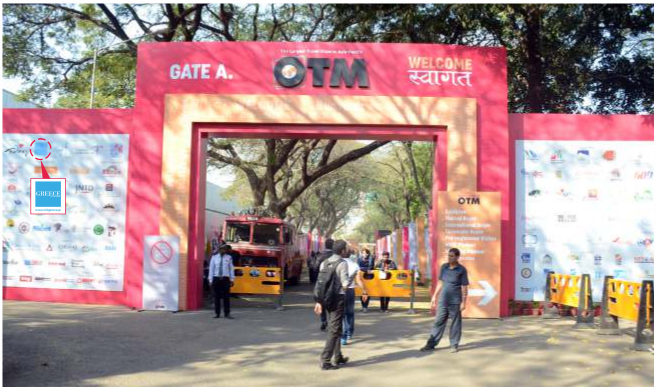
Main Entrance Gate