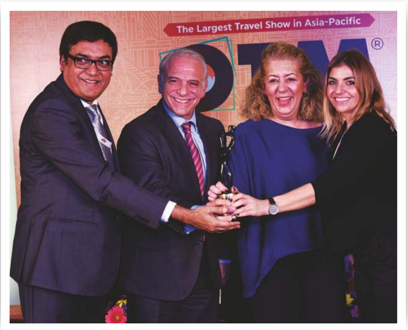
Greek National Tourism Organisation Winning Best Destination Award at OTM 2018