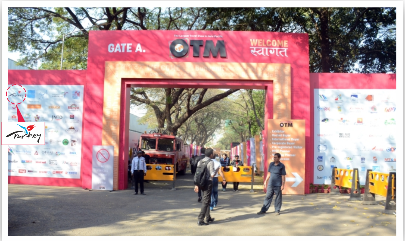
Main Entrance Gate