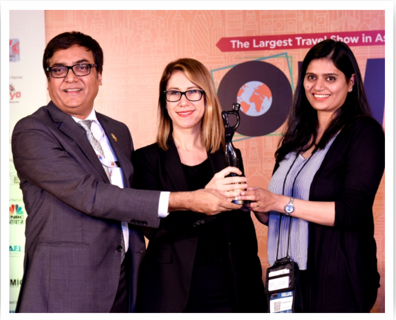
Turkish Culture & Tourism Office Winning Best Destination Award at OTM 2018